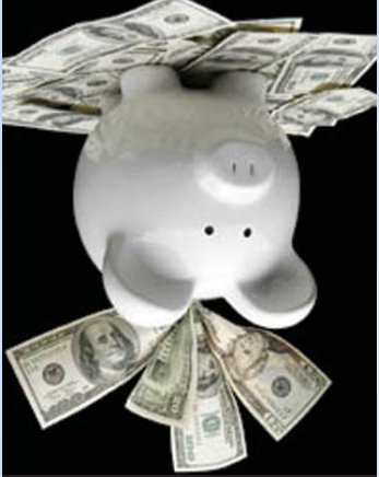
Sewer backups can be costly!